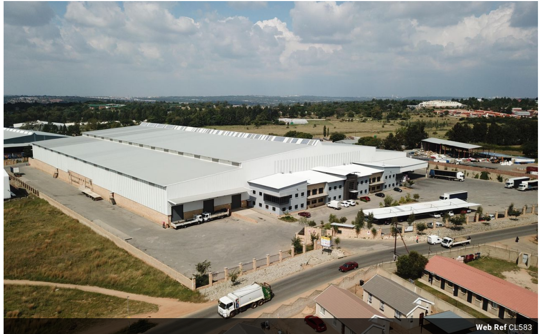
Web Ref CL583

384 Johan Road Cnr Taylor Road Honeydew. 2040