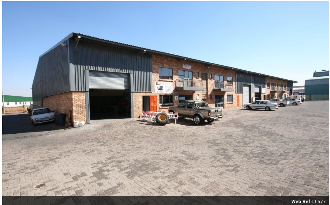
Web Ref CL577

384 Johan Road Cnr Taylor Road Honeydew. 2040