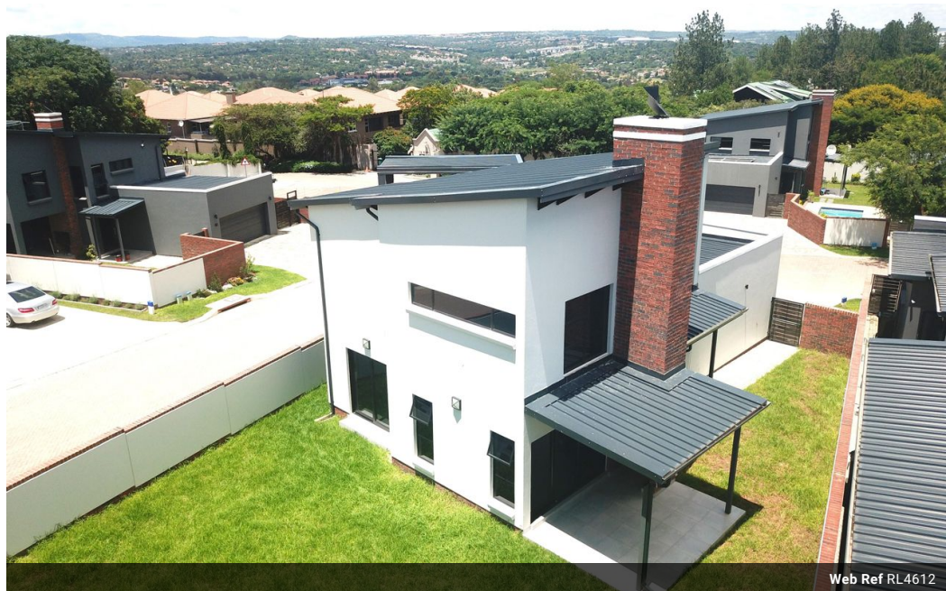
Web Ref RL4612

384 Johan Road Cnr Taylor Road Honeydew. 2040